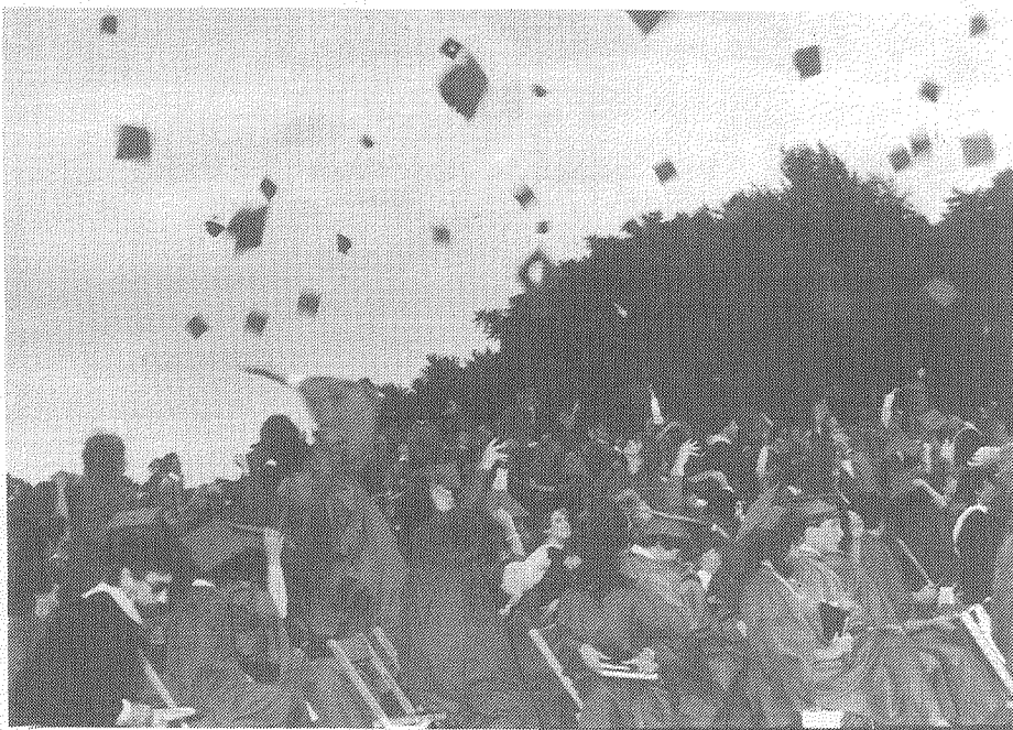
Raucous behavior at last year's graduation ceremony contributed to this year's cancellation.